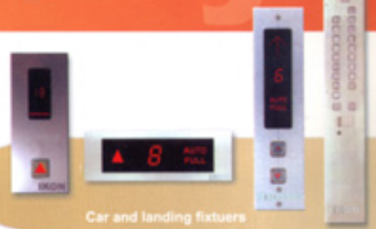
Car and landing fixturs