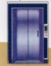
Telescopic Manual Door