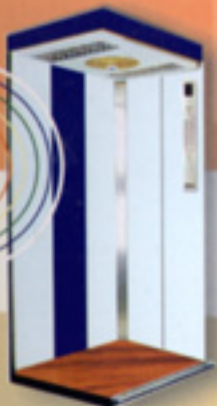
M.S. Powder Coated Cabin