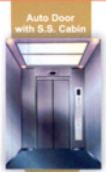
Auto Door with S.S. Cabin