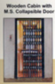
Wooden Cabin with M.S. Collapsible Door