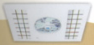
Choice for False Ceiling