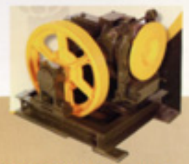
HIGH SPEED MACHINE UNIT