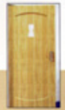
Dura-tek Swing Door