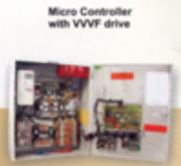
Micro Controller with VVVF drive