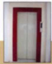
S.S. Auto Door